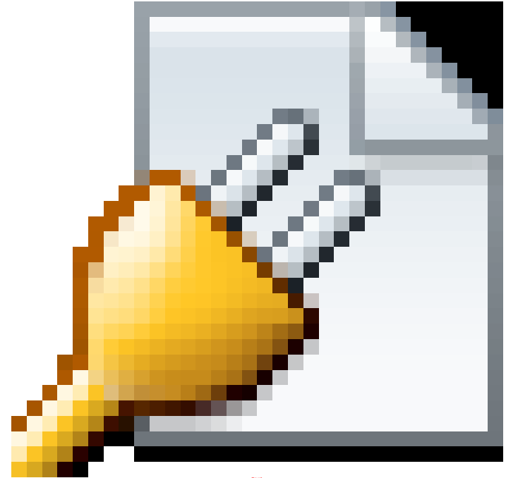
PART 4 slave laborers dug industries under ground to avoid bombing www.youtube.com/watch?v=fPZC5x6BSI8